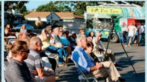
Some of the Talent Show audience and the Food Truck