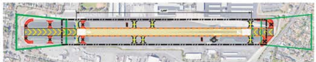
Option - A