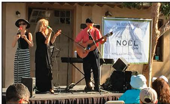
The Polytones